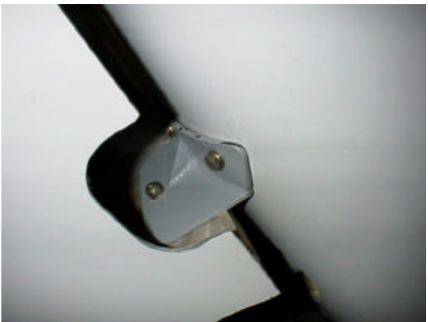
Step 8. Final drill / ream the 8 spar pin holes and install spar pins.

Remove one temporary spar pin at a time and drill the hole to it's final dimension using piloted drill bits and an 90° offset ½" Drill. Step drill, no more than 1/8" at a pass, and the spar pinhole to 23/32" Diameter. Use a ¾" piloted ream and ream the hole to it's final dimension. Drive the spar pin into the hole so that it is flush with the aft side of the carrythrough. Install the safety bolts and washers. Use lock tight to secure bolt into hole.